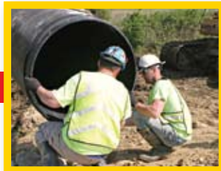
A gasket is installed on the next piece of pipe, assuring a watertight seal when connected.