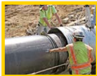
Using chains and pressure from the excavator, the two pieces of pipe are 'snapped' together. The process is repeated until connected sections of Snap-Tite® are pushed through the entire length of the culvert.