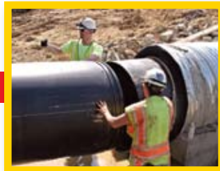
The second piece of pipe is lowered into position, and lined up with the first piece.