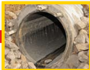
Different length PVC pipes that will deliver the grout flow are installed, and both ends of the pipe are sealed.