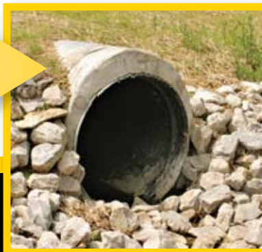
The totally rehabbed Snap-Tite® culvert. Nearly all the work was completed off-road in the culvert itself. No road closure or traffic interruption occurred.