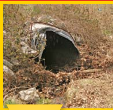
A typical deteriorated culvert close to failure, potentially leading to road collapse and danger to the motoring public.