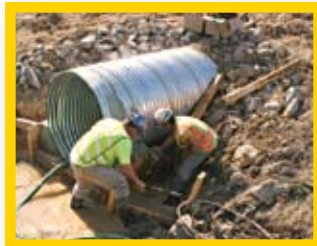
The same culvert, excavated and prepared for Snap-Tite® rehab. Since the pipe was so deteriorated, this project required the installation of a corrugated metal sleeve to accept the new pipe. A concrete footer was also poured.