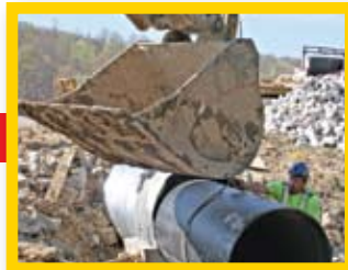
The first piece of Snap-Tite® HDPE is lowered into position and inserted into the existing pipe.