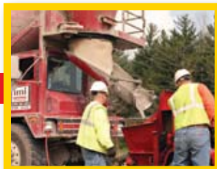
Workers prepare the low density cellular grout that will be pumped into the pipe.