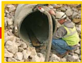
The grout is pumped into the entire length of the pipe, filling in all voids between the new and old pipe, and the areas between the pipe and roadway.